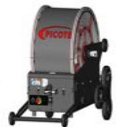
System includes: Xpress Pump, Hose Reel, Reel Heating Blanket, Small Diameter Hose Package, and 10 Static Mixing Tips & Y-Fitting Package